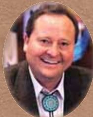
Governor Brian Schweitzer